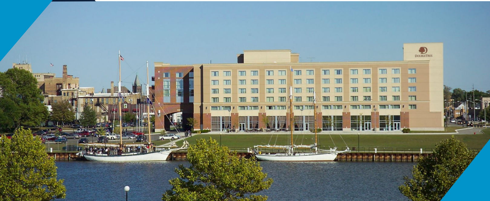
DoubleTree by Hilton | Bay City, MI

TO REGISTER FOR OTHER CRA EVENTS VISIT: micountyroads.org/Events